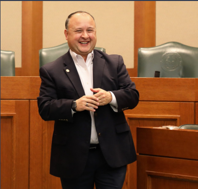
2019 LEAD Conference

We appreciate the investment of time, energy, and knowledge he puts into this organization. May you continue to inspire us for many years to come. Happy 20th Anniversary.