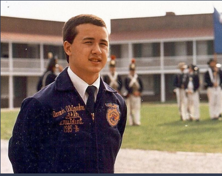
Texas FFA Association President, 1985-86