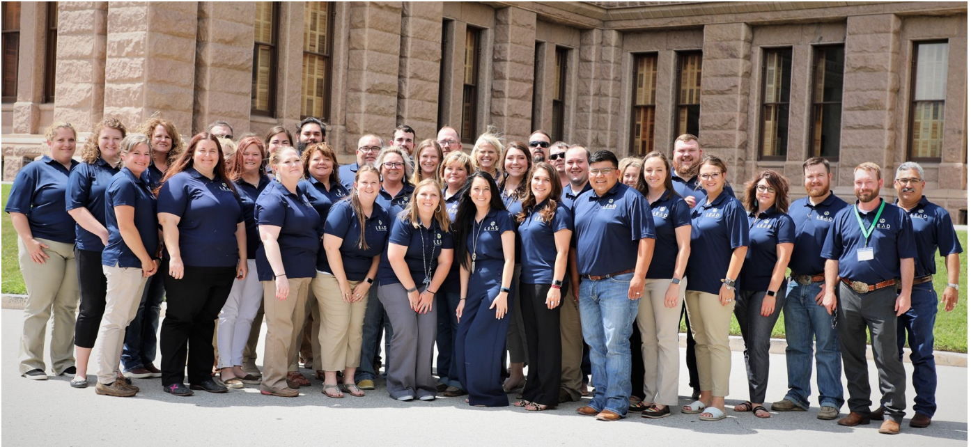
2019 LEAD Experience