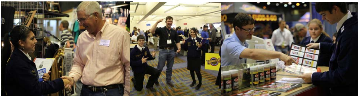
Exhibit & Career Expo

Businesses, organizations and universities have a unique opportunity to interact with the approximately 12,000 members and guests with more than 100 exhibitors sharing their goods and services.